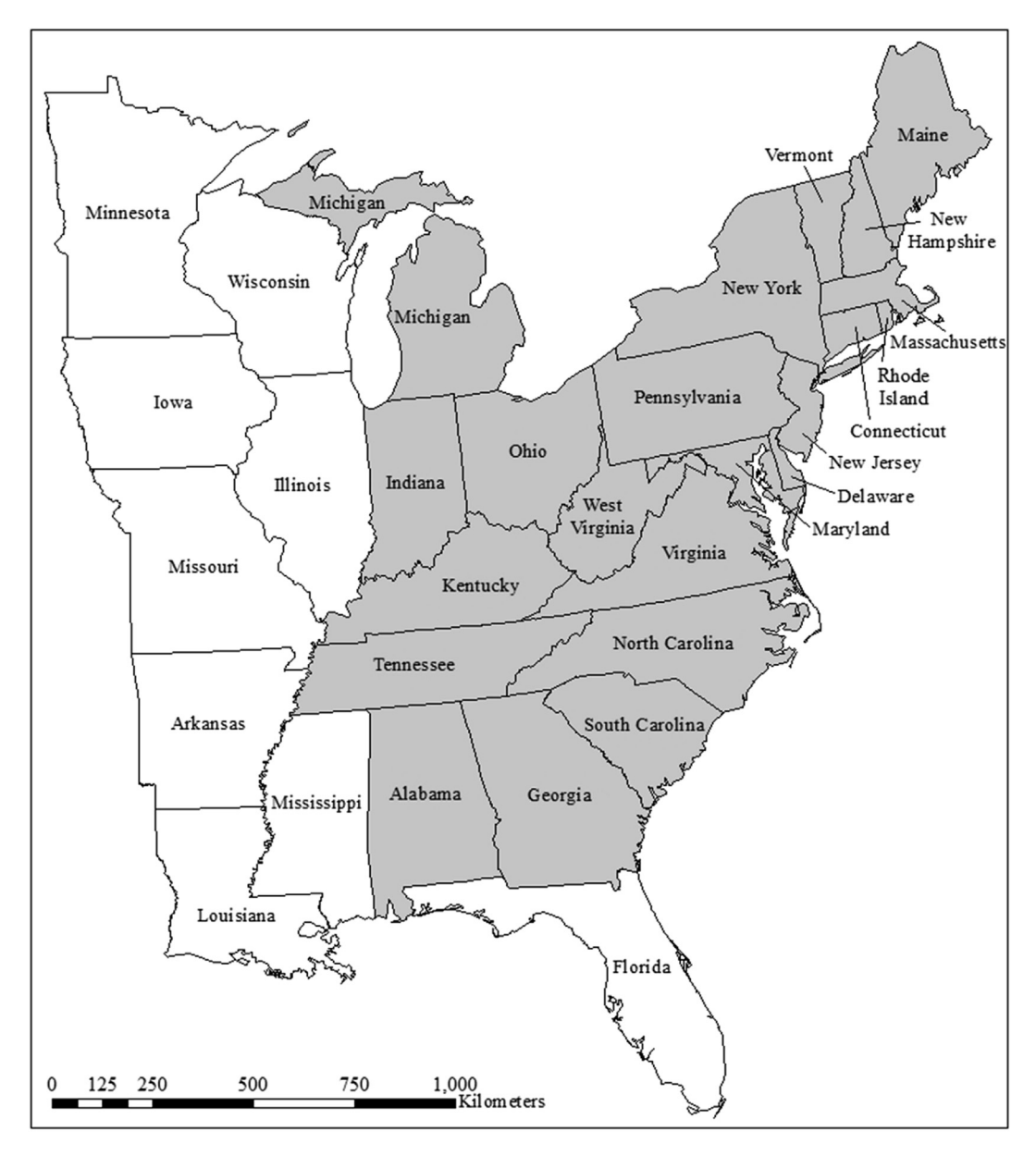
Fig. 1. Establishment of house finch populations in the eastern United States. Populations established prior to 1982 were part of this study (grey, n = 22 states); states with populations that were <10 years old by 1991 were too new to be included and delineated the western and southern borders of the study area (white).

curve (Ratkowsky, 1990). The model assumes the curve originates at x = 0, y = 0. We used SAS Enterprise Guide 4.3 (SAS Institute, Inc., Cary, NC) to parameterize the models. PROC GLM was used for the null and linear models and PROC NLIN was used for the nonlinear model. The latter procedure uses an iterative approach to determine parameter estimates and requires that seed values be specified (SAS Institute Inc., 2011). We specified \alpha by plotting finch density against feeder density and estimated the plateau value based on the visualization ( \alpha_{1991} = 7 , \alpha_{1996} = 3 , \alpha_{2001} = 3 , \alpha_{2006} = 3 ). We arbitrarily specified \beta at 0.5 for all years. We ranked models by comparing AICc values and assessed relative support for the models in each year using model probabilities (Burnham and Anderson, 1998). Models with AICc values within four units of the top model were considered competitive (i.e., well-supported alternative models compared to the top-model). To determine the existence and type of indirect effects of bird feeding on finch populations, we tested for a linear relationship between changes in